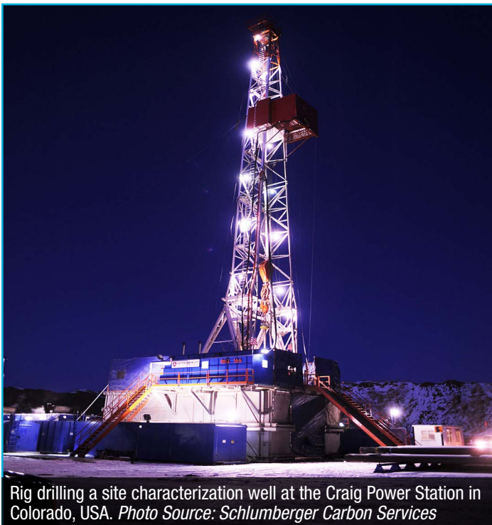
Rig drilling a site characterization well at the Craig Power Station in Colorado, USA.

Newsletters, program fact sheets, best practices manuals, roadmaps, educational resources, presentations, and more information related to the Carbon Storage Program is available on DOE's Energy Data eXchange (EDX) website .